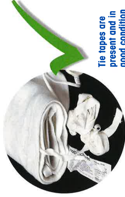
Tie tapes are present and in good condition