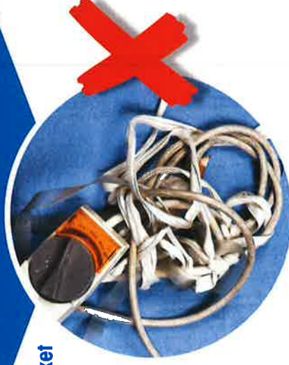
Old blanket wiring