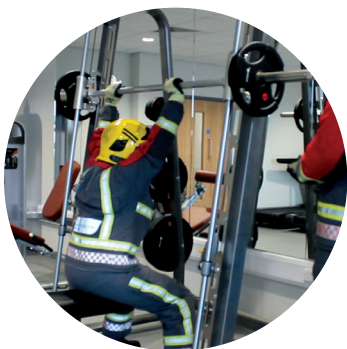
Simulated ladder lift may involve raising a bar of around 5-15kg off the ground, lifting it above your head and back down to the floor