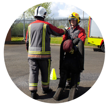
Casualty evacuation tests your lower and upper body strength and ability to walk backwards while dragging a weight of around 55kg