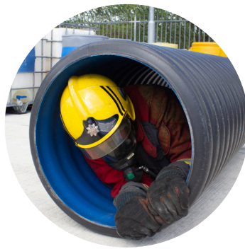
Enclosed space entry tests your agility and confidence working in this environment