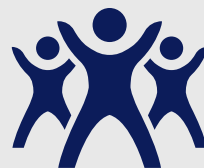
Group exercise classes