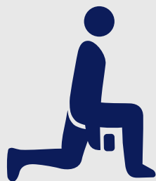
Load carriage lunge