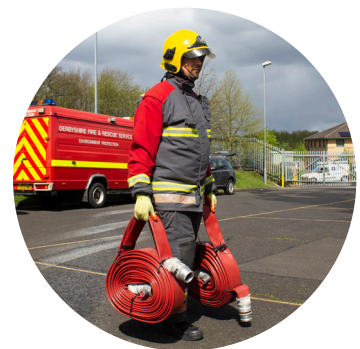
Equipment carry tests your cardiovascular fitness, muscular strength and endurance by carrying and running with a hose