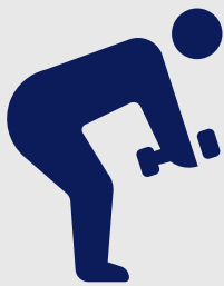
Bent over row