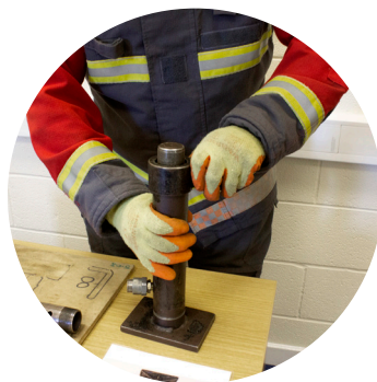
Equipment assembly tests your manual dexterity and ability to follow instructions to assemble and disassemble a piece of equipment