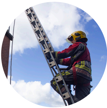
Ladder climb tests your confidence and ability to work at heights

Don't worry if you haven't done these kinds of exercises before. You will be given clear guidance and instruction on how to use the equipment involved, as well as a demonstration of each individual test. You may be required to wear firefighter Personal Protective Equipment and undertake the following tasks: